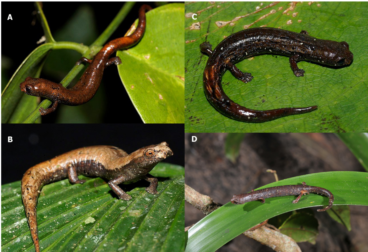
Fig. 1. Bolitoglossa leandrae : subadult male CVUNET 645 (A) and adult female CVUNET 644 (B), both from Quebrada La Espuma, Río Frío, Táchira state, Venezuela. Bolitoglossa tamaense : adult females CVUNET 615 (C) and CVUNET 626 (D), both from Matamula, between Bramón and Delicias, Táchira state, Venezuela.

The Valle del Río Doradas is an important area for Orinoquian and Upper Amazonian herpetofauna (contrasting with the surrounding typical Llanos and Andes elements), as demonstrated by Barrio-Amorós and colleagues for other amphibian species like Hypsiboas lanciformis Cope 1871, H. boans (Linnaeus 1758), Scinax wandae (Pyburn and Fouquette 1971), Lithodytes linea-